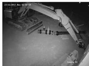
Monitored excavator and refuelling station during night time hours

The sentinel is a complete self-sustaining intruder detection system which will protect any area from unwanted visitors.