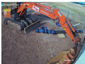
Monitored excavator and refuelling station during daylight hours